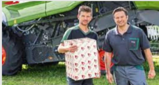
Premium Aftersales Service