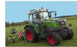
Battery electric Traktor Fendt e100 Vario