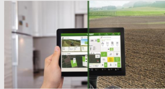
Digital Fendt Experience