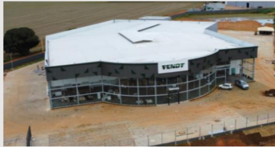
Customer Connected Distribution